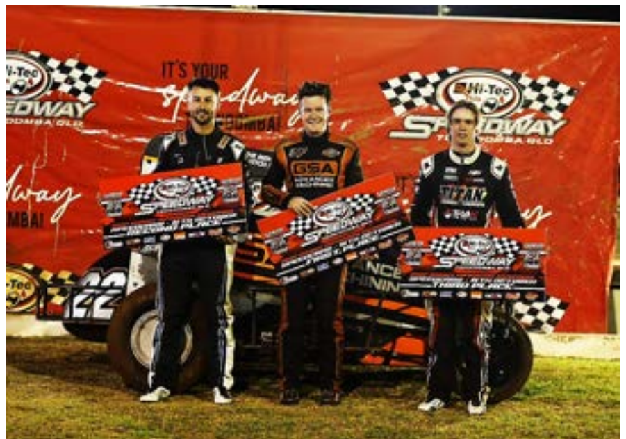
Podium image from last months Speedcar event